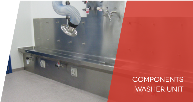
COMPONENTS WASHER UNIT