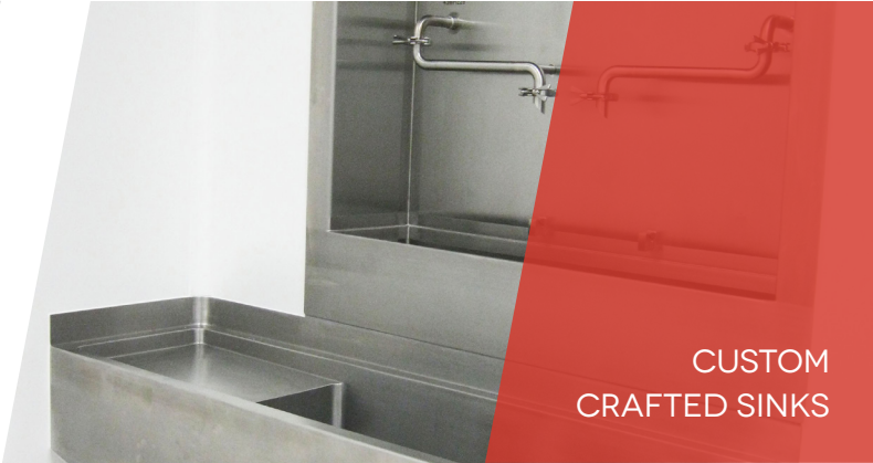
CUSTOM CRAFTED SINKS